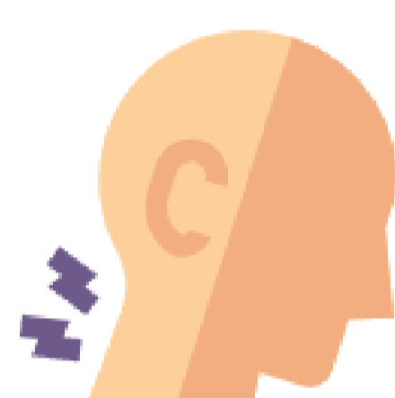
Ergonomic Neck Support