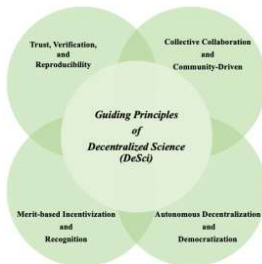
Figure 2. Graphical illustration of the guiding principles of Decentralized Science (DeSci).

An illustrated overview of the guiding principles of DeSci is shown in Figure 2.