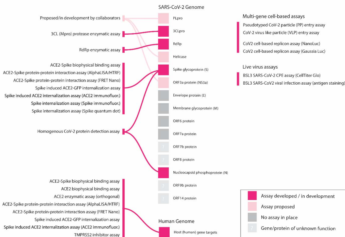
Figure 2. NCATS SARS-CoV-2 assays currently employed to address a range of both viral and host targets. Overview of established assays and those in development. These include assays for specific viral targets, viral-host interaction assays, viral detection assays and viral cytopathic effect and replication assays, among others.

In total, over 10,000 compounds are being tested in full concentration-response ranges from across multiple annotated small molecule libraries including: (1) The NCATS Pharmaceutical Collection (NPC), a library of 2,678 compounds approved for use by the Food and Drug Administration and related agencies in other countries 12,13 ; (2) a collection of 739 anti-infective compounds with potential anti-coronavirus activity that have been reported in the literature as repurposing candidates; and (3) an annotated/bioactive collection of diverse small molecules with known mechanisms of action, including as small molecule probes and experimental therapeutics designed to modulate a wide range of targets, such as natural products, epigenetic-associated compounds or compounds developed for oncology indications 14,15 . Together, these libraries yield 9,958 compound responses, 8,624 of which represent structurally unique compounds, of which 1,820 (21%) are approved for use in humans with an additional 989 (11%) having entered human clinical evaluation (Phase 1-3 trials). Importantly, of these unique compounds, 5,224