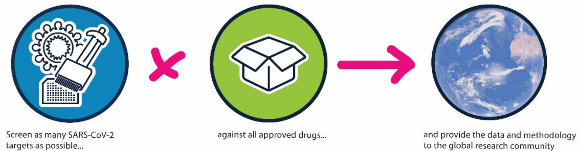
Figure 1. OpenData portal objective. The goal of the OpenData portal is to provide actionable data and validated methodologies to the global research community to support rapid development of therapeutics against SARS-CoV-2.

The assays that have been developed to date cover a wide spectrum of the SARS-CoV-2 life cycle ( Figure 2 ), including both viral and human (host) targets, grouped into the following five categories based on different mechanisms of experimental design: viral entry, viral replication, in vitro infectivity, live virus infectivity, and counter-screens, which could flag false positives due to assay interference artifacts or cytotoxic effects. These assays encompass protein-based assays such as the SARS-CoV-2 spike protein-ACE2 interaction and viral enzyme activity assays, in addition to cell-based pseudotyped particle entry and live virus cytopathic effect assays. As additional assays are validated and screened, this list will be expanded and updated. Importantly, all assay documentation including assay overview, methodology and detailed assay protocols are available, and readily retrievable, on the OpenData site to facilitate adoption and ensure that other laboratories can replicate these assays ( Table 1 ).