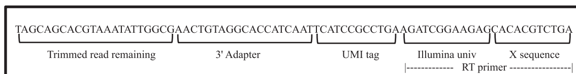
Fig. 2. UMI read architecture. The raw sequenced read is divided into the following parts: 1. Trimmed read remaining - is the first part of the read, which codes for the mature miRNA sequence. 2. 3' Adapter - fixed length (19 nucleotide [nt]) of Illumina adapter sequence. 3. UMI tag - stands for Unique Molecular Identifier (UMI) tag of fixed length of 12 nt. 4. Illumina univ - stands for Illumina Universal adapter of fixed length of 12 nt. 5. X seq - stands for a random sequence of nucleotides, when read in combination with Illumina universal adapter makes up for the Reverse Transcription (RT) primer.

also the most correct reads based on their UMI tag. Since it is imperative to retain and trim only those reads having the 3' adapter the sequencer will read into the adapter in order to capture miRNAs. The utility of UMIs is only seen post-alignment as there is greater confidence in the genomic read location. Since the length of mature miRNAs is known to be around 22–25 bp, the final raw read filtering step is to trim the reads to retain only the expected miRNA read lengths with some leniency, to remove reads that are either too short (<18 bp) and too long (>30 bp). The result of UMI analysis and read filtering is a set of good quality raw sequences, ready to be processed for any analysis, such as alignment.